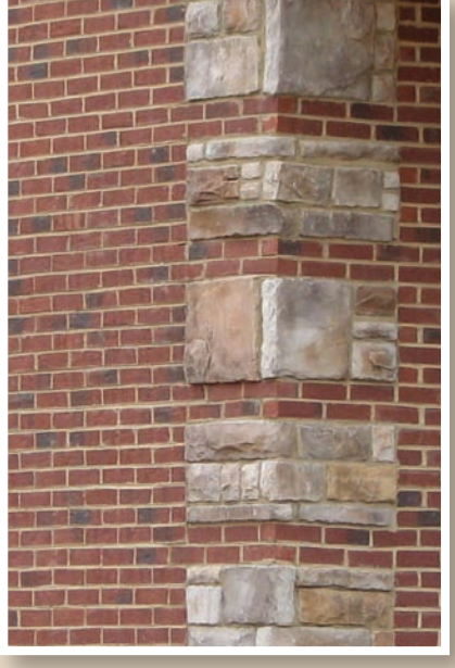
Pictured: Dusty Grey

There are so many creative ways to implement stone and brick in the details, the possibilities are truly unlimited. You may stagger quoins around corners or create straight clean contemporary lines. Trim out your windows, arches, or garage doors. Integrate a patch of brick in the stone or vice versa. No other product available compliments brick so perfectly and easily.