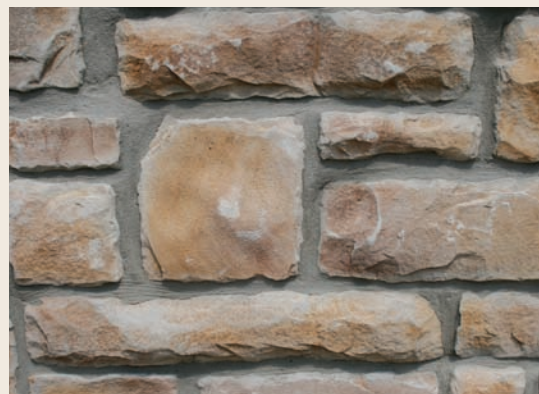
Cherokee Colonial Grey Sunflower