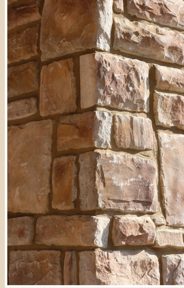
Pictured: Sunflower with Buff Mortar

is a remarkable patent pending product designed to change the face of manufactured stone products. It is manufactured in sizes that are equal to brick dimensions. This simplifies the installation in unison with brick and other masonry products. It is installed in the same manner as brick using the time proven weep hole water shed system for a beautiful, convenient, maintenance free stone product.