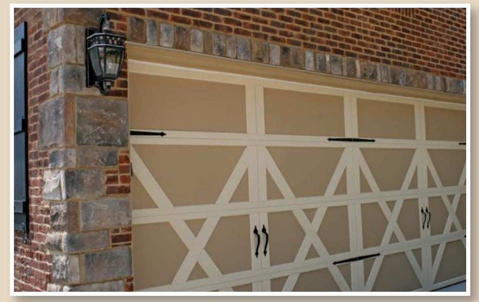
Pictured: Dusty Grey