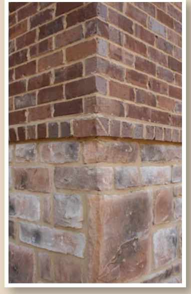
So simple a brick mason can easily install our products, eliminating the need to hire a specialty stone mason.