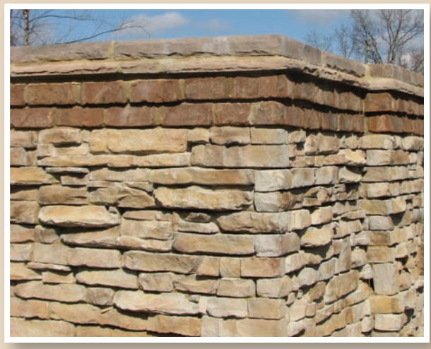
Pictured: Cumberland Ledgestone/Sunflower