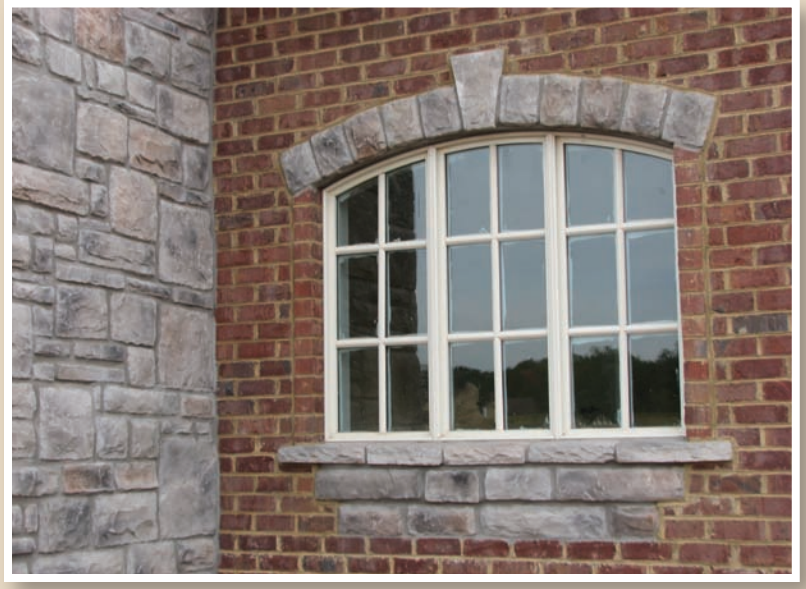
Pictured: Kentucky Grey