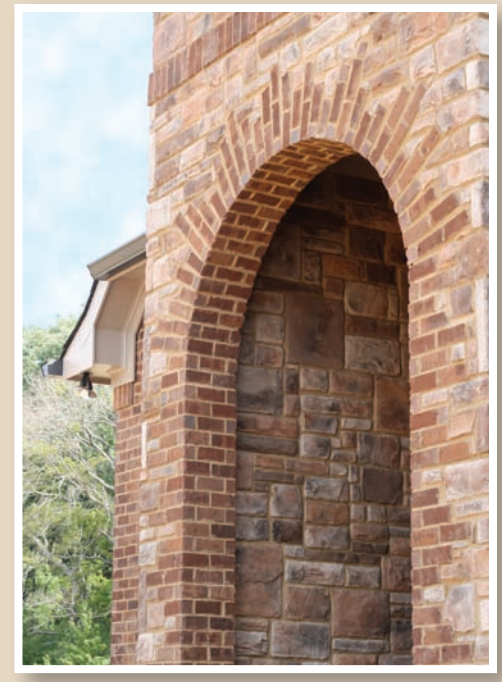
Pictured: 60% Autumn Brown/40% Earth Blend